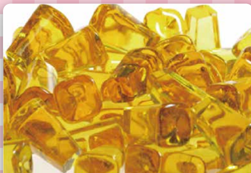
OGONTOH CO., LTD. Candies 3-8-21-100 Shimizuoka Sumiyoshiku Osakashi Osaka Japan 558-0033 http://www.ogontoh.co.jp