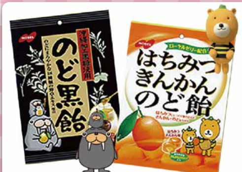
NOBEL CONFECTIONERY CO., LTD. Candies 4-10-2 Tatsumikita Ikunoku Osakashi Osaka Japan 544-0004 http://www.nobel.jp