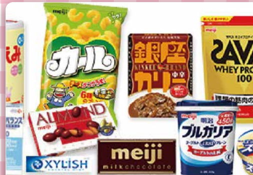
MEIJI HOLDINGS CO., LTD. Branded Consumer Foods 2-2-1 Kyobashi Chuoku Tokyo Japan 104-8306 http://www.meiji.co.jp