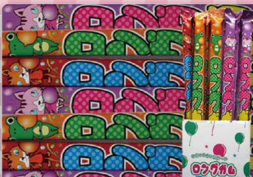
NOZAKI CONFECTIONERY CO., LTD. Chewing Gum 2-22 Johokucho Nishiku Nagoyashi Aichi Japan 451-0023 052-522-3161