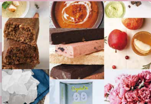
STRONGHEART CO.,LTD. Branded Consumer Foods 3-16-13 Roppongi Minatoku, Tokyo Japan 106-0032 http://www.chewing-gum.org