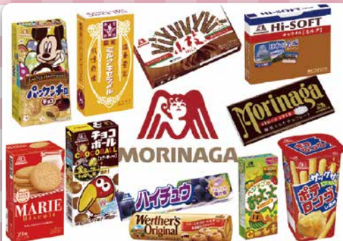
MORINAGA & CO., LTD Branded Consumer Foods 5-33-1 Shiba Minatoku Tokyo Japan 108-8403 http://www.morinaga.co.jp