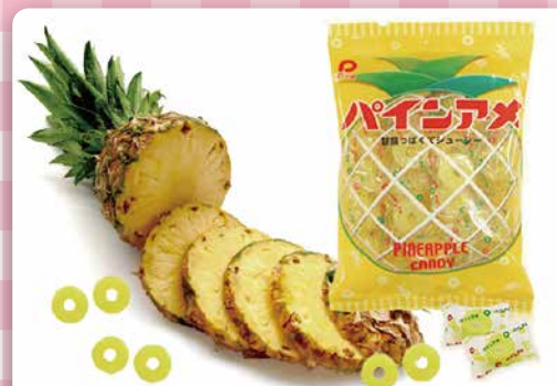
PINE CO., LTD. Candies 1-5 Ikutamateramachi Tennoujiku Osakashi Osaka Japan 543-0073 http://www.pine.co.jp