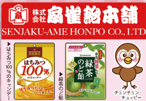
SENJAKU-AME HONPO CO., LTD. Candies 2-5-2 Kawarayamachi Chuoku Osakashi Osaka Japan 542-0066 http://www.senjakuame.co.jp